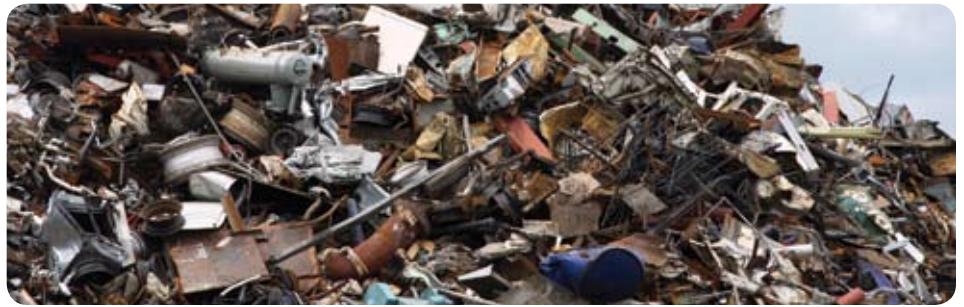
Waste generated at special events. (Source: 2005 CIWMB Special Event Waste Audit)