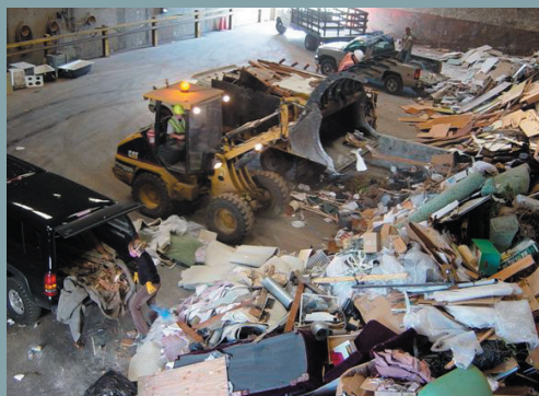
C&D Recovery at the Shoreway Recycling and Disposal Center

In 2006, 18,575 tons of construction and demolition (C&D) debris were recovered through a program with Allied Waste—a 67% increase over 2005.